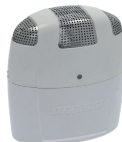
LF Code: 3010134 GEV Code: LF3010134

for refrigerators up to 500 L capacity It kills all types of bacteria and viruses and is able to prevent the growth of mildew it reduces food decay it eliminates pesticides, herbicides and stale odours it extends the shelf life of food voltage DC 4.5V / 3 AAA batteries (not included) Ozone production 5 mg/h dimensions 90x90x33 mm