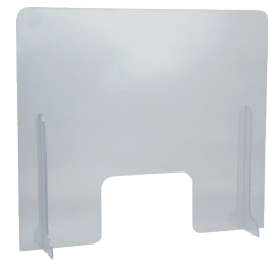
LF Code: 3091060 GEV Code: LF3091060

The kit includes: 3091048 Washable double layer mask (5 pcs) 3716010 Face visor 3092360 Hand cleaner gel IDRAL70 (1 L)