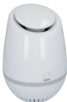
LF Code: 3610036 GEV Code: LF3610036

Voltage DC 6V / 4 batteries D (not included) Ozone production 12 mg/h For refrigerators up to 700 L Dimensions 133x73x140 mm Kills bacteria and viruses Prevents the growth of mold Eliminates pesticide and herbicide residue and stale odours, reduces food decay