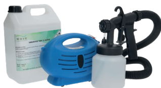
LF Code: 3096001 GEV Code: LF3096001