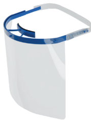
LF Code: 3716010 GEV Code: 802512

body range 32-42.9°C (89.6°-109.2°F) accuracy \pm 0.2^{\circ}\text{C} - \pm 0.4^{\circ}\text{F} measuring distance 1-15cm ambient operating temperature -25/+55°C automatic shutdown after 5 sec power supply DC 3V - 2 batteries R03 AAA 1.5V (not included) dimesions 95x60x180 mm - weight 146 g