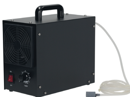
LF Code: 3010059 GEV Code: LF3010059

AC 100-240V 50/60Hz adapter DC 12V 10W Ozone production 200 mg/h For areas measuring 50-80 \text{m}^3 Dimensions 162x162x230 mm Eliminates viruses and bacteria in the air Eliminates all odours