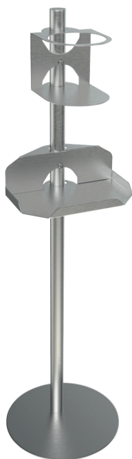
LF Code: 3716011 GEV Code: LF3716011

Compressed air Professional equipment for nebulising detergents and disinfectants Rilsan spiral hose 7.5 m