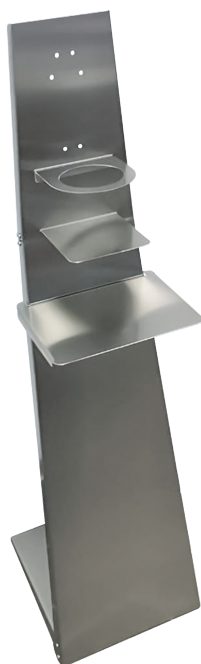
LF Code: 3716012 GEV Code: LF3716012

100% AISI 304 stainless steel Solid, free-standing structure h 100 cm Support for dispenser - Max diameter 100 mm (dispenser not included) 2x dispenser-fastening bands Shelf for gloves, tissues or masks All elements can be removed for easy cleaning and sanitising