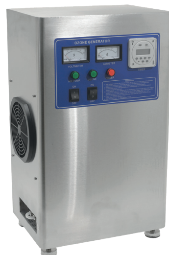
LF Code: 3610050 GEV Code: LF3610050

90W 3A 220V 50/60Hz Ozone production 2800 mg/h Purifies up to 200 \text{m}^3 Eliminates viruses and bacteria in air and water Eliminates all odours Reduces food deterioration