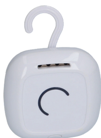
LF Code: 3010284 GEV Code: 802231

DC 12V-0.5W for car lighter plug ANIONS concentration 6 millions \text{cm}^3 OZONE production 10 mg/h for areas measuring 3/4 \text{ m}^3 dimensions 23x23x95 mm