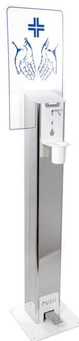
LF Code: 3716015 GEV Code: LF3716015

Made entirely of stainless steel Ready for dispenser application both manual and touch Dimensions 300 x 330 x H 1190 mm