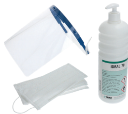
LF Code: 3091061 GEV Code: 802513

Thickness 0.25 mm - dimensions 260x210 mm Tested, approved materials Easy, practical disinfection To prevent the formation of visible stains Wash with water after sanitising