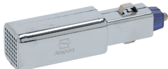
LF Code: 3610022 GEV Code: LF3610022