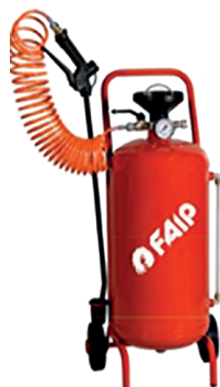
LF Code: 3070410 GEV Code: LF3070410

230/240V - 50HZ - 650W tank capacity 800 ml - hose length 1.5 m weight 1900 g includes: 5L sanitising fluid, main unit, hose, carrying belt, viscosity measuring glass, spray gun, tank, cleaning clip