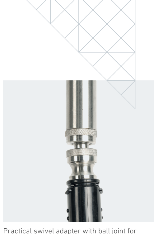
Practical swivel adapter with ball joint for large radius of action

Water flow is activated by pulling the spray gun Built-in pressure spring prevents the spray head from springing back and enables ergonomic working