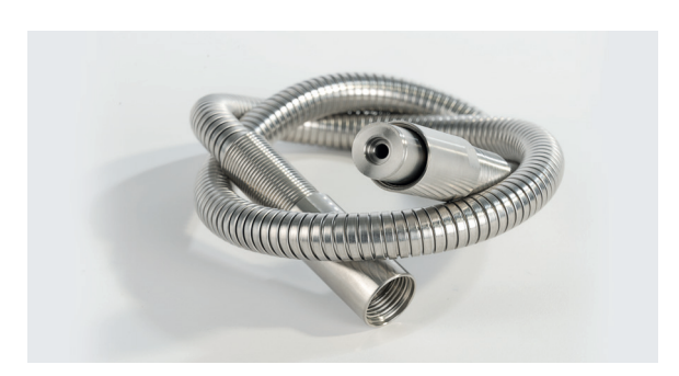
LF Code: 5118026 GEV Code: 549485