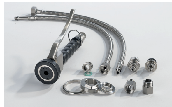
With an additional connection adapter for 1/2" \div 3/8" for easy and smooth installation