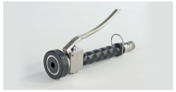
LF Code: 3360029 GEV Code: 546509