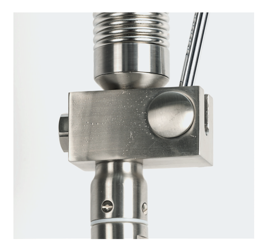
High-quality automatic valve made of stainless steel components