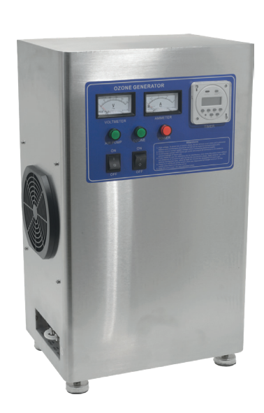
LF Code: 3610050 GEV Code: LF3610050

natural hygienisation process 90W 3A 220V 50/60Hz ozone production 5 g/h purifies up to 10-15 m² in 20-30 minutes eliminates viruses and bacteria in air and water eliminates all odours reduces food deterioration