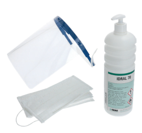
LF Code: 3091061 GEV Code: 802513

body range 32-42.9°C (89.6°-109.2°F) accuracy \pm 0,2 °C - \pm 0.4 °F measuring distance 1-15cm ambient operating temperature -25/+55°C automatic shutdown after 5 sec power supply DC 3V - 2 batteries R03 AAA 1.5V (not included) dimesions 95x60x180 mm - weight 146 g