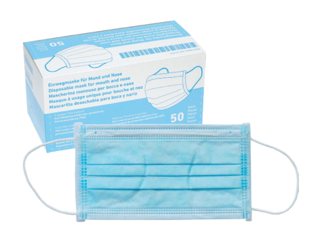
LF Code: 3091046 GEV Code: 802500