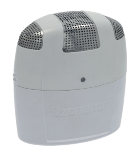
LF Code: 3010134 GEV Code: LF3010134

for refrigerators up to 500 L capacity It kills all types of bacteria and viruses and is able to prevent the growth of mildew it reduces food decay it eliminates pesticides, herbicides and stale odours it extends the shelf life of food voltage DC 4.5V / 3 AAA batteries (not included) Ozone production 5 mg/h dimensions 90x90x33 mm