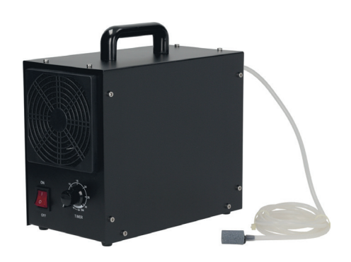
LF Code: 3010059 GEV Code: LF3010059

natural hygienisation process AC 100-240V 50/60HZ adapter DC 12V 10W ozone production 200 mg/h for areas measuring 50-80 m³ dimensions 162x162x230 mm eliminates viruses and bacteria in the air eliminates all odours