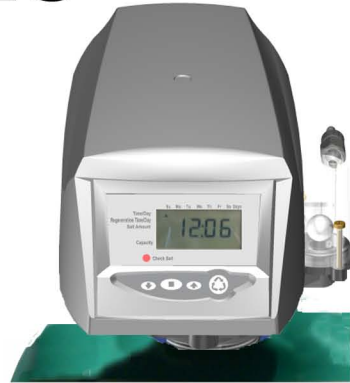
AUTOTROL 255 / 740 LOGIX VALVE